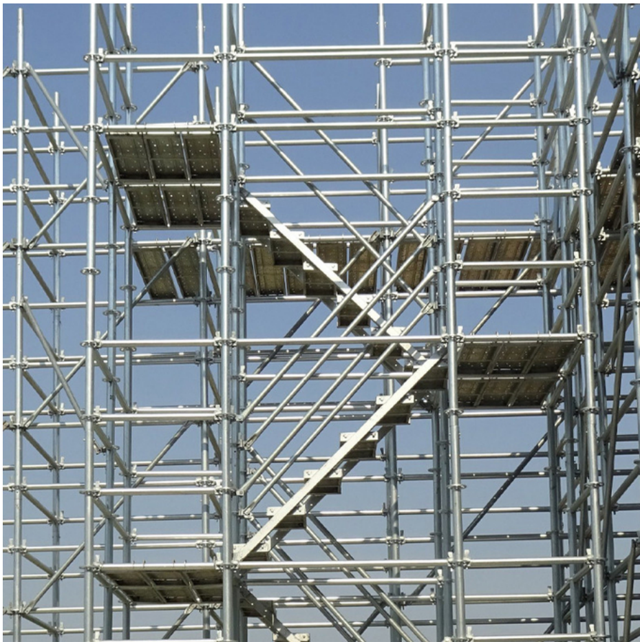
Participate in projects